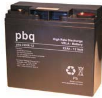
Photograph shows optional F terminals